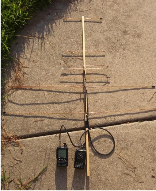
My WA5VJB - minus matching network - and two HT setup