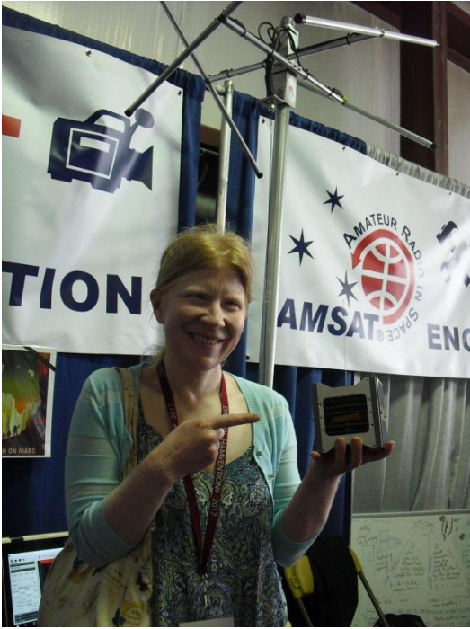
Me holding a cubesat model at Hamvention 2017

Later that year I built a 2 meter/440 cheap LEO (low earth orbit) satellite Yagi designed by Kent Britain WA5VJB of DFW. Building the antenna was sort of a dry run for a possible club building project. It turned out to be fairly involved due to the very specific measurements needed, lots of cutting and drilling, not to mention the construction of a small matching network to run both sides of the antenna in full duplex mode. That's not to say that we could not build these as a club, however there would definitely need to be some preemptive kitting of the parts and cutting of antenna elements before the event in order to save time. I learned a lot constructing the antenna, including how tight the specs on the matching network need to be in order to get good SWR and power out, but all in all, it went well. This little homebrew gem works well as a directional antenna for any type of 2 meter or 440 contacts. It performed wonderfully with my Yaesu FT2DR on local repeaters.