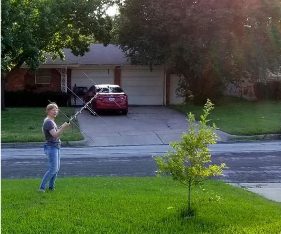
Working satellites with the Arrow in the front yard.